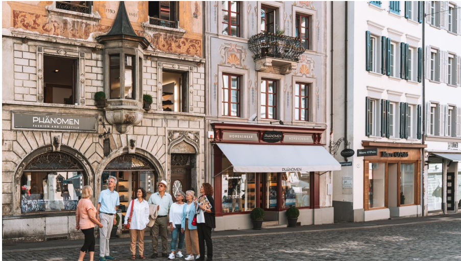
Luzern Tourismus, Laila Bosco