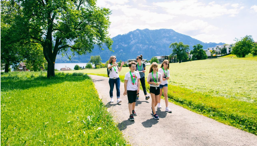
Foxtrail Helios Vitznau Weggis