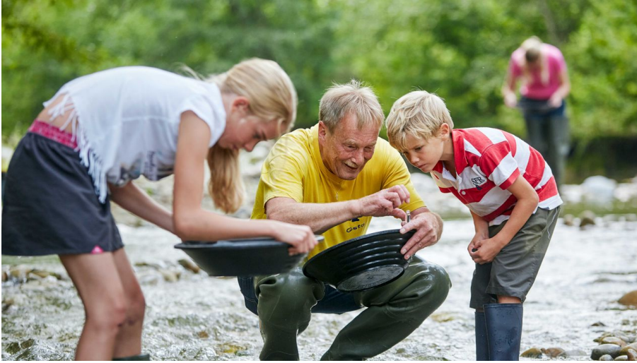
Gold panning in the Napf area