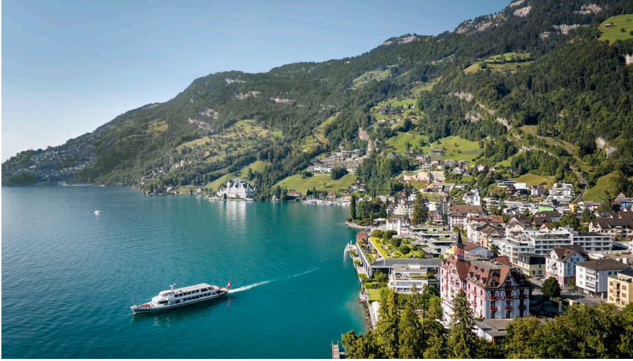
Riviera scavenger hunt Vitznau