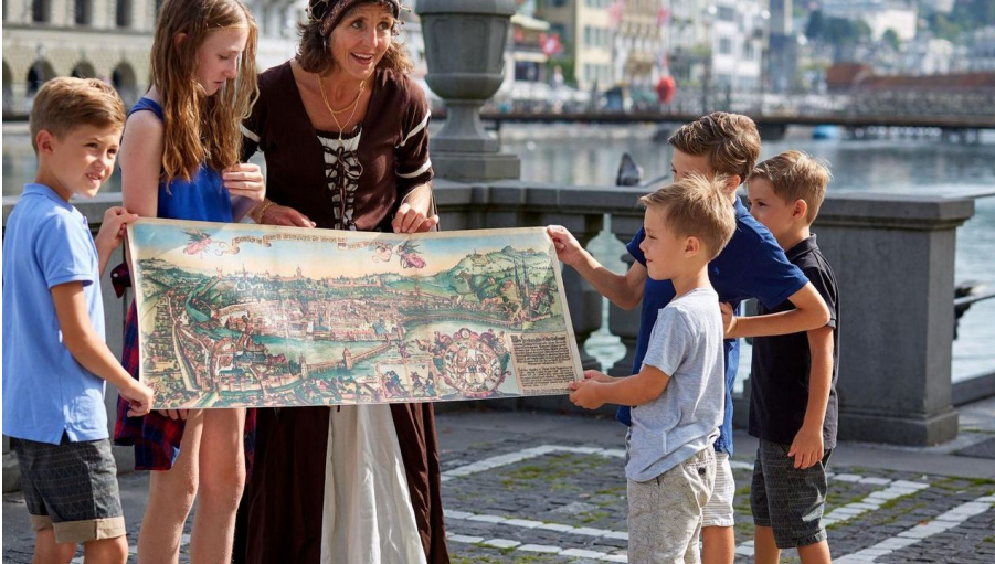
Adventure tour for children