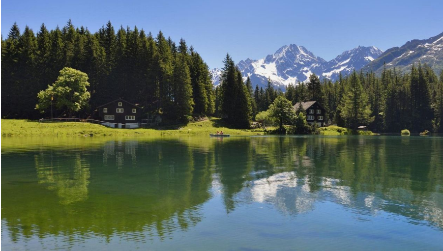
Lake Arni in Intschi - © Luzern Tourismus