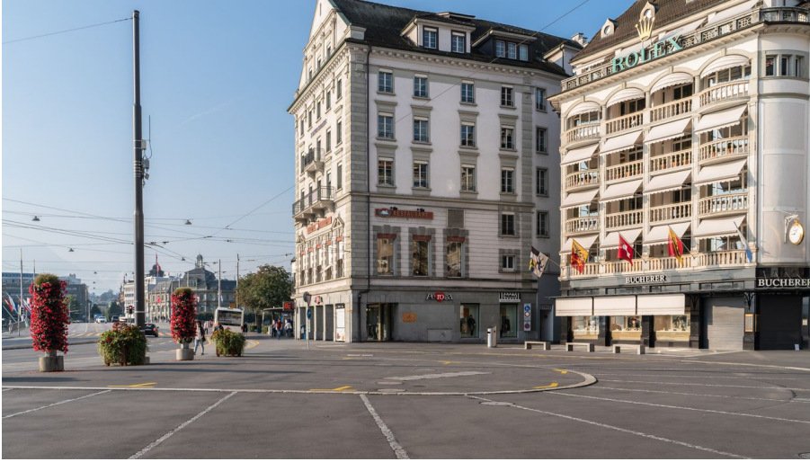
Bucherer Jeweler Lucerne