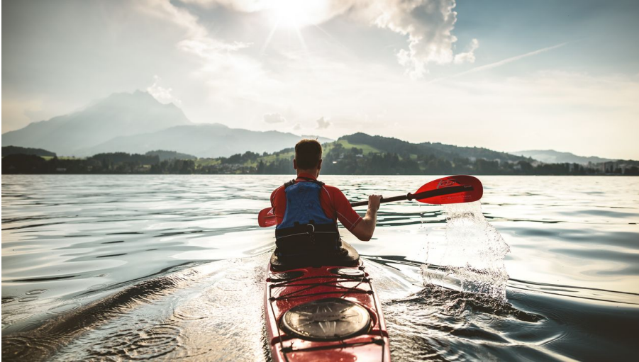
Canoe World_Buochs_Nidwalden.jpg