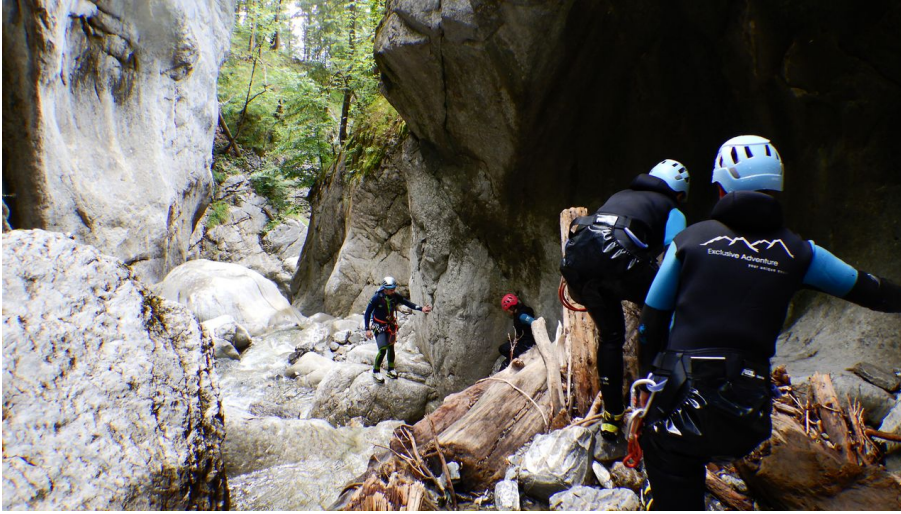
Canyoning with Outventure_Nidwalden