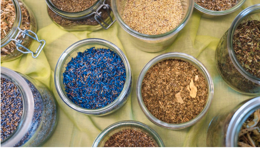
UNESCO Biosphäre Entlebuch / Laila Bosco, laila_bosco