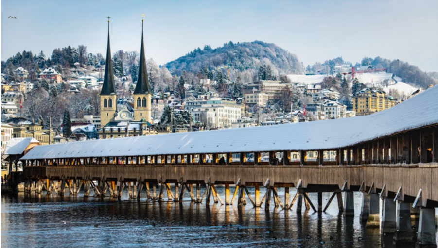
Church of St. Leodegar