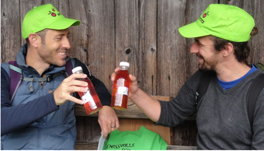
Seetal Tourismus, FoodTrail