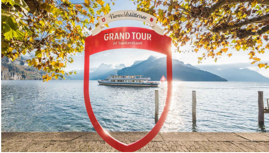
Fotospot_GrandTour_Brunnen - © Foto: Mattias Nutt Photography