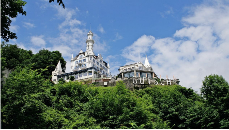
Chateau Gütsch