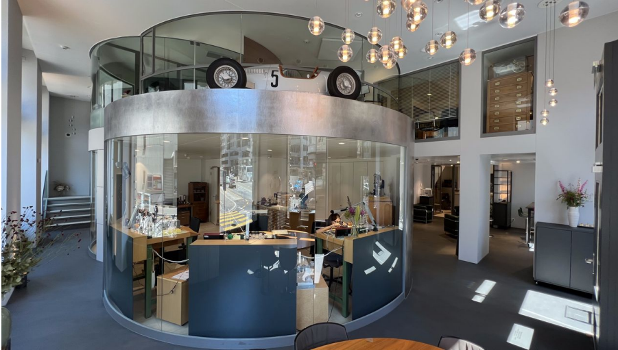
House of Chronoswiss