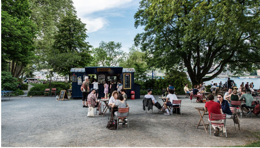
Inseli