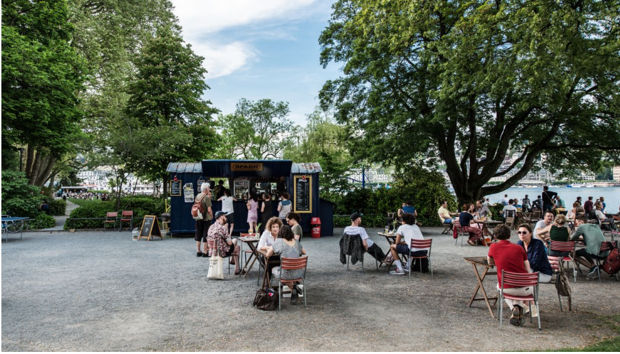
Inseli