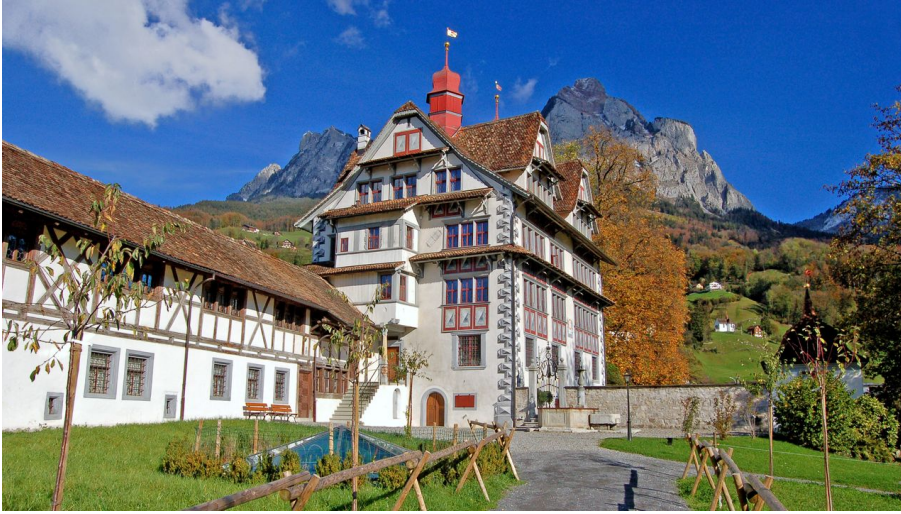
Stiftung Ital Reding-Haus, IG Wiege der Schweiz - info@wiegederschweiz.ch