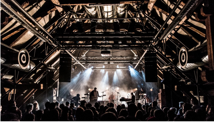
Live concert in the Schüür