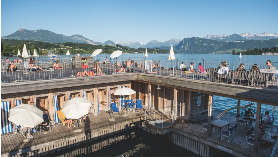
Lakeside resort Lucerne