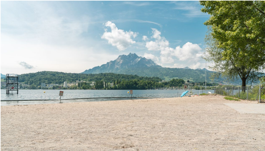
Luzern Tourismus, Laila Bosco