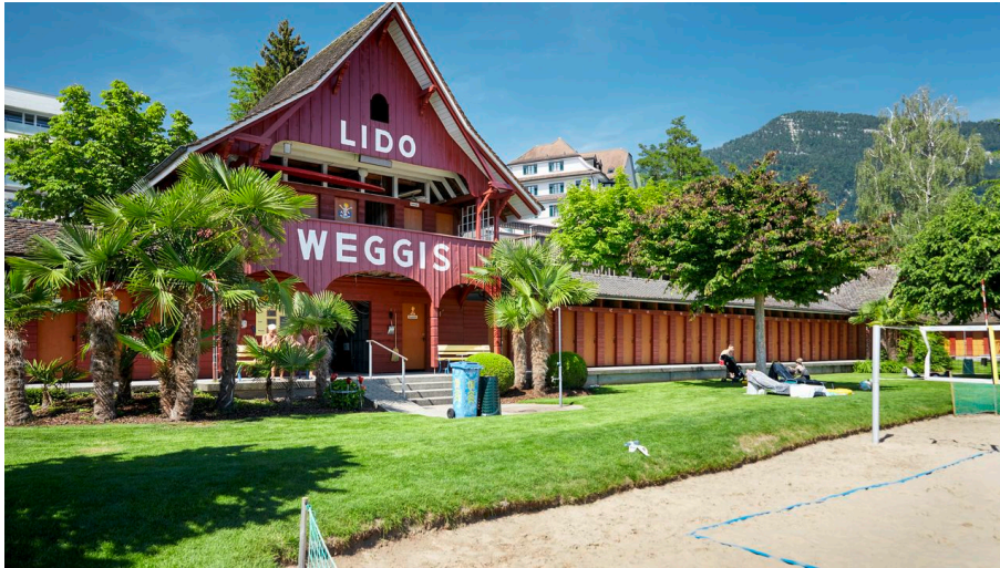
Lido indoor swimming pool Weggis - © Beat Brechbühl | Luzern Tourismus