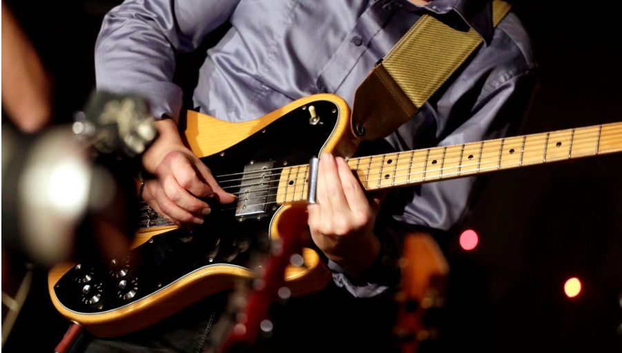
Lucerne Blues Festival