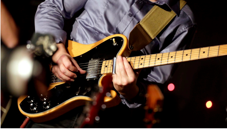
Lucerne Blues Festival