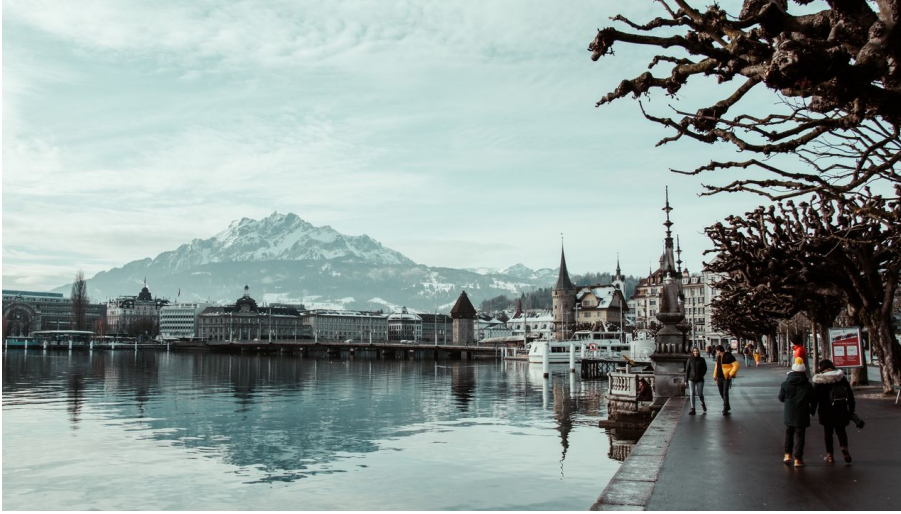
Lake promenade in autumn