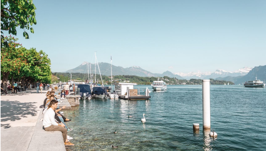
Lake promenade in summer - © Luzern Tourismus, Laila Bosco