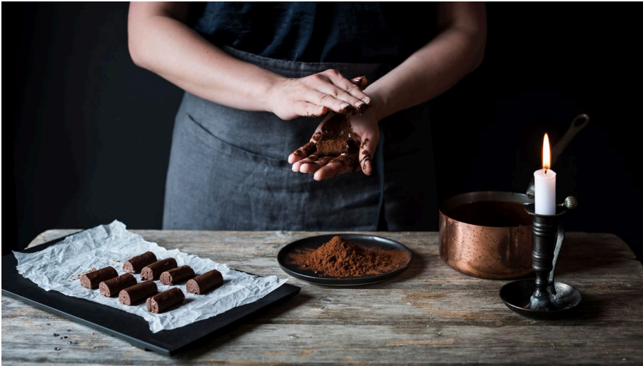
MaxChocolatier Creation