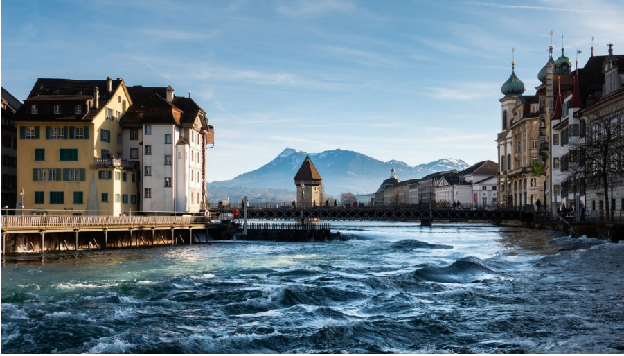
Needle Dam - © Luzern Tourismus, Elmar Bossard