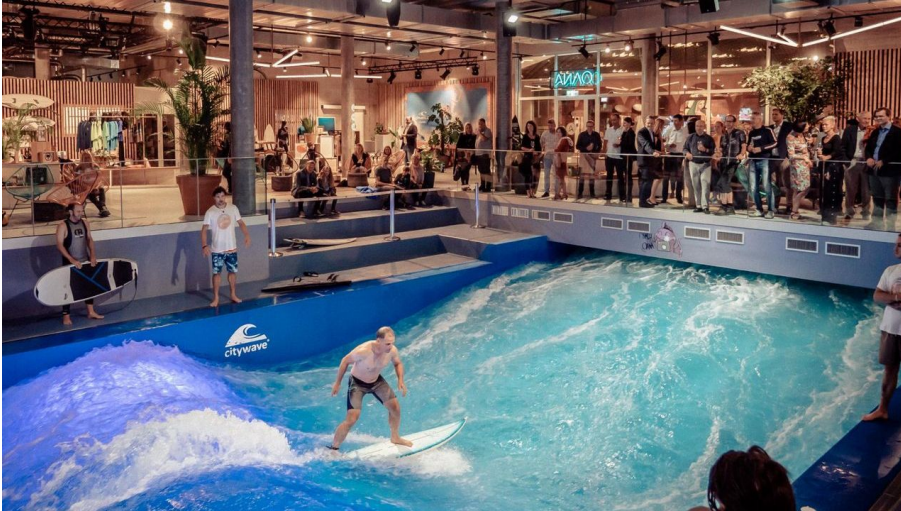
OanaSession - © Luzern Tourismus