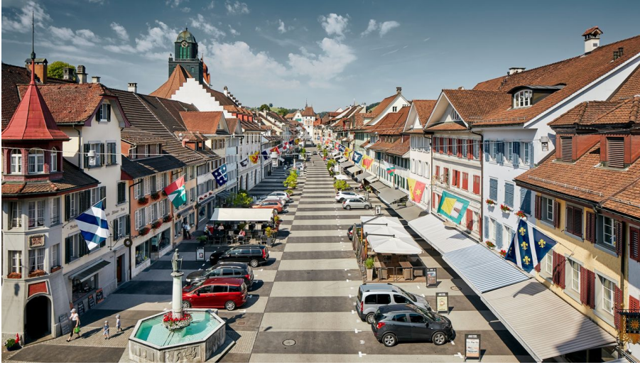
Willisau Tourismus, Willisau Tourismus