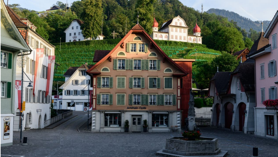
Samuel Büttler Photographie