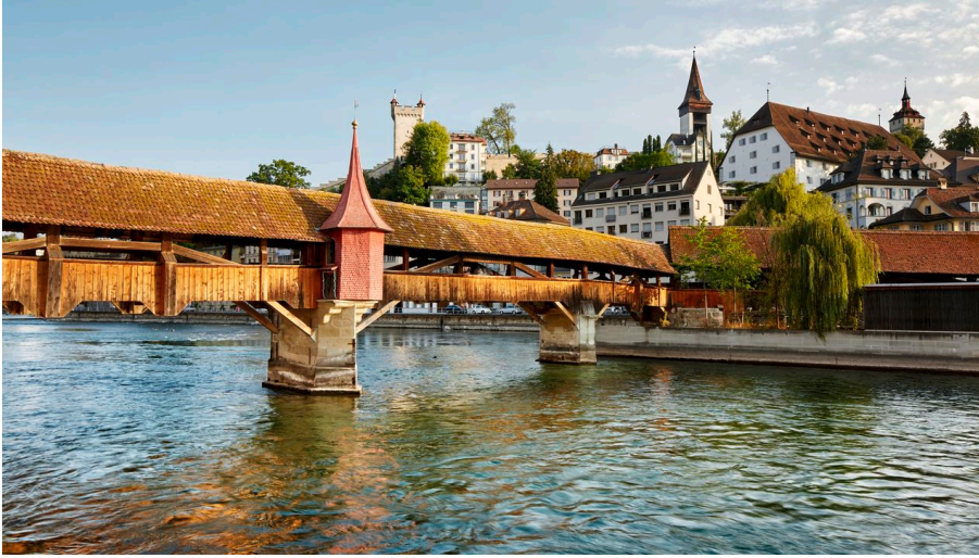
Spreuer Bridge