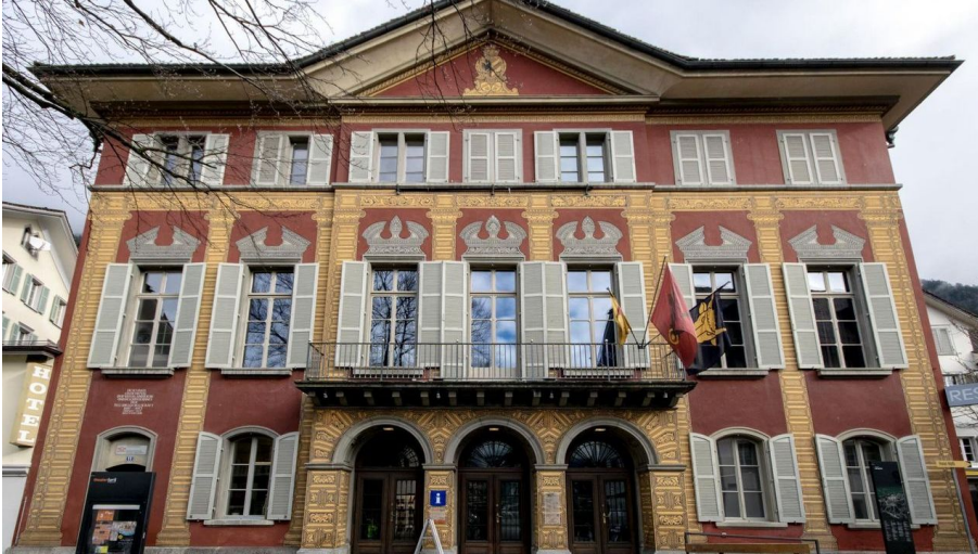
Theatre Uri - © Uri Tourismus