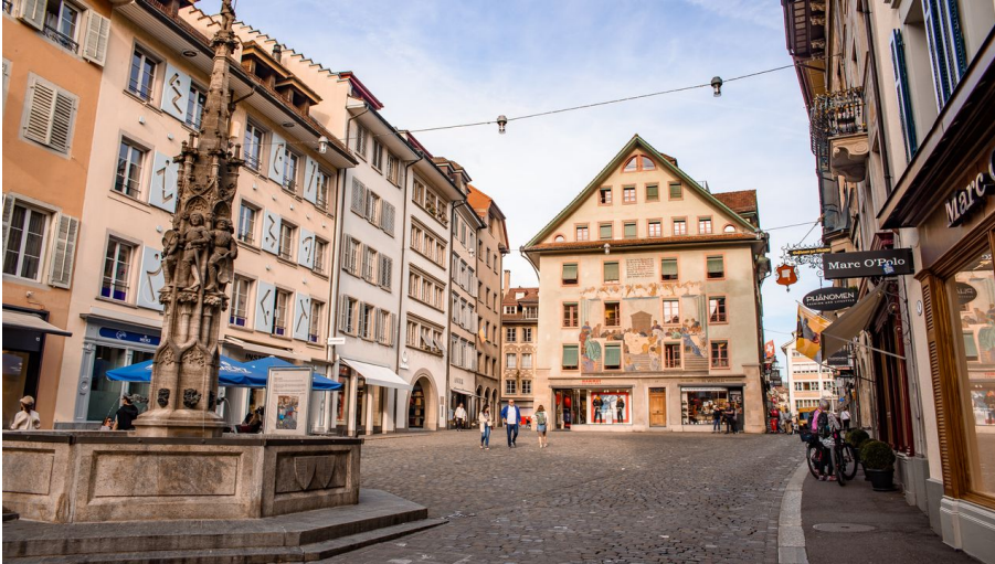
Weinmarkt - © Luzern Tourismus, Tanja Müller