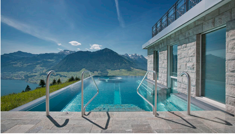
Outdoor pool Hotel Villa Honegg