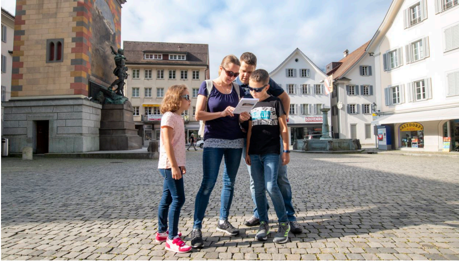
Where is Walterli - Scavenger hunt