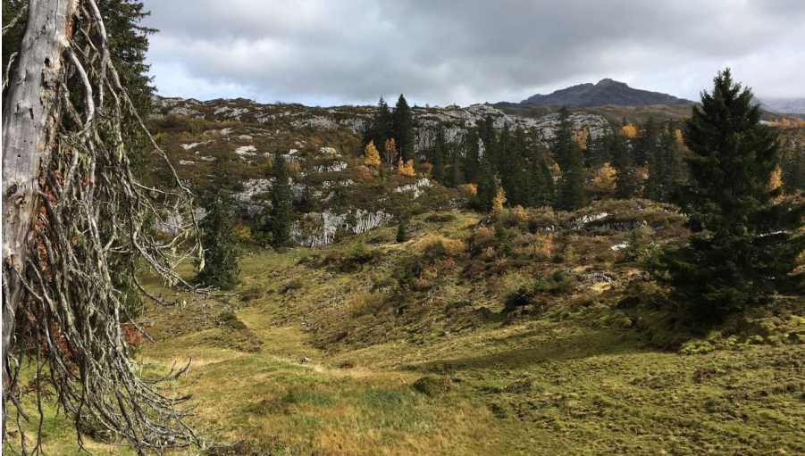
Stoos-Muotatal Tourismus, Stoos-Muotatal Tourismus GmbH