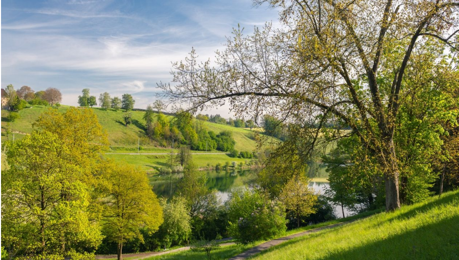
Laila Bosco, Luzern Tourismus