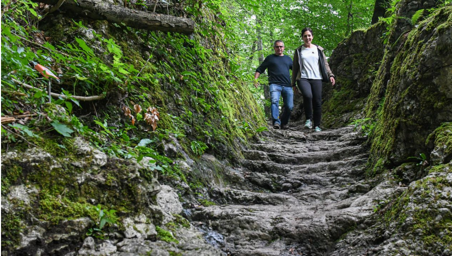
Obwalden Tourismus, Obwalden Tourismus