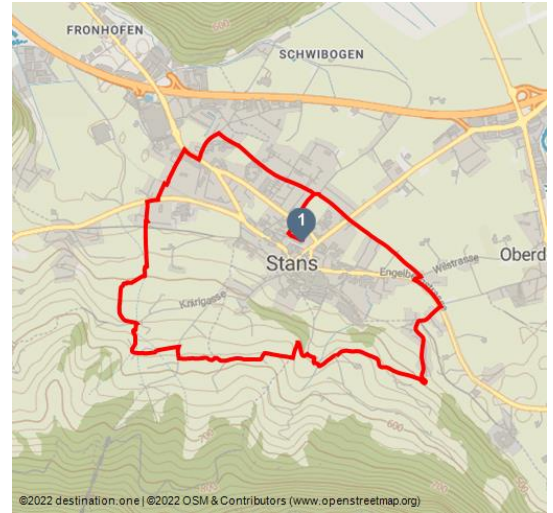
©2022 destination.one | ©2022 OSM & Contributors (www.openstreetmap.org)