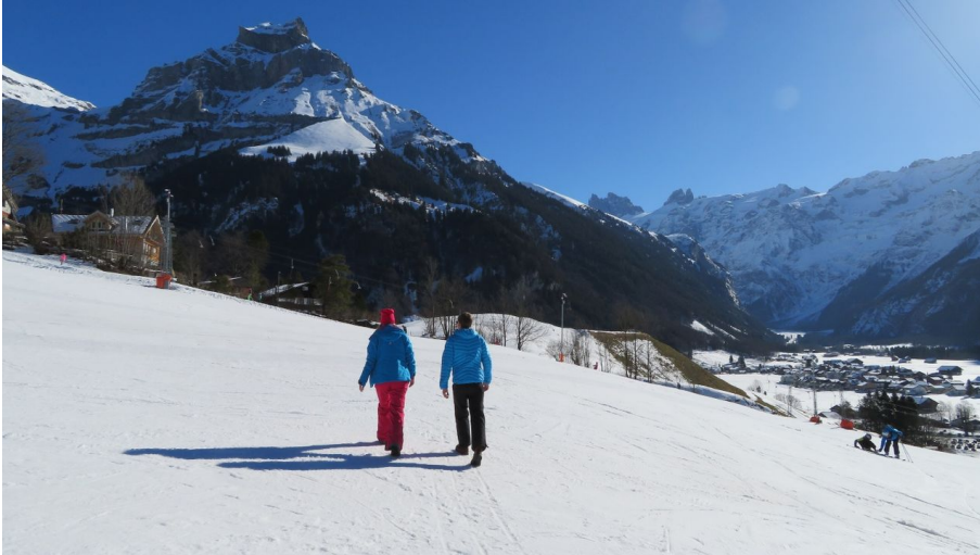
Engelberg - Titlis Tourismus, Engelberg-Titlis Tourismus