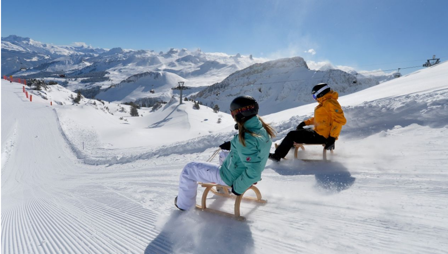
Stoos-Muotatal Tourismus, Stoos-Muotatal Tourismus GmbH