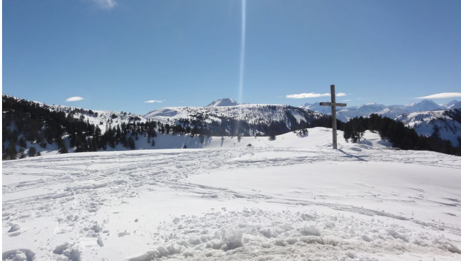
Obwalden Tourismus, Obwalden Tourismus