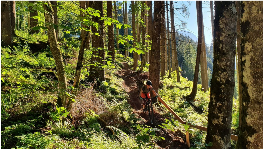
Engelberg - Titlis Tourismus, Engelberg-Titlis Tourismus