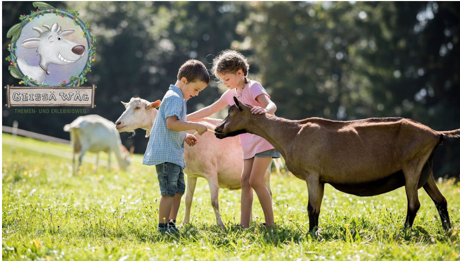
Erlebnisregion Mythen, Schwyzer Wanderwege