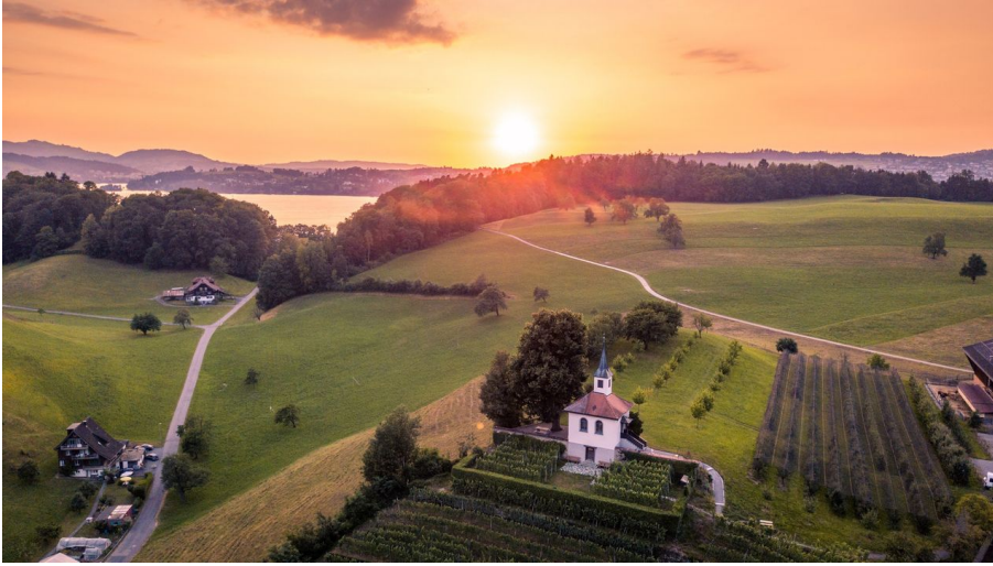
Tourist Information Weggis (Luzern Tourismus AG), Tourist Information Weggis