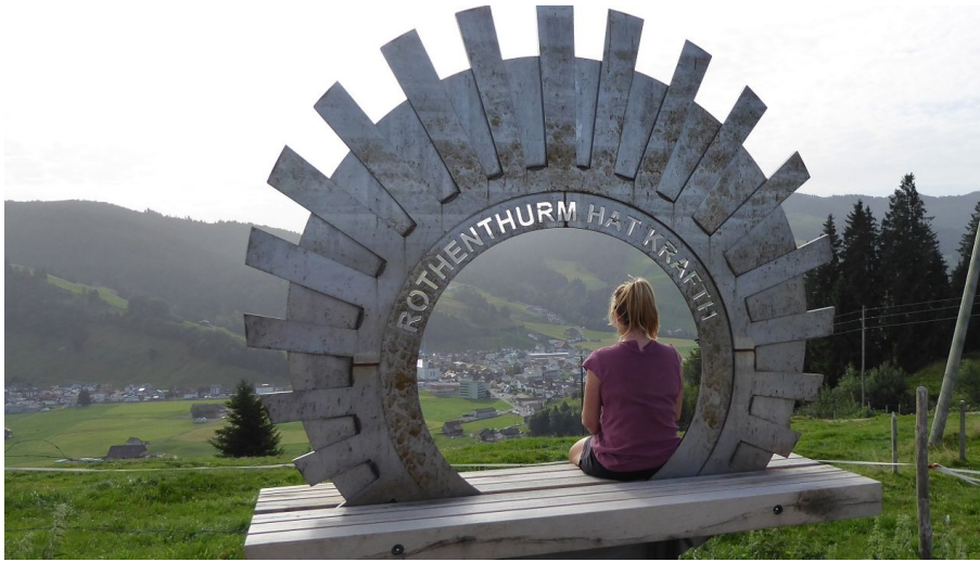
Rothenthurm Tourismus, Erlebnisregion Mythen