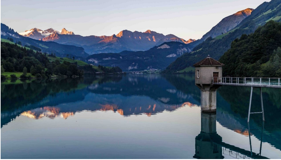
Obwalden Tourismus, Obwalden Tourismus