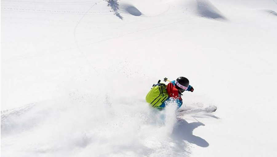
Engelberg - Titlis Tourismus, Engelberg-Titlis Tourismus