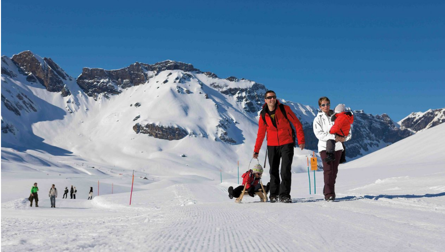
Obwalden Tourismus, Obwalden Tourismus