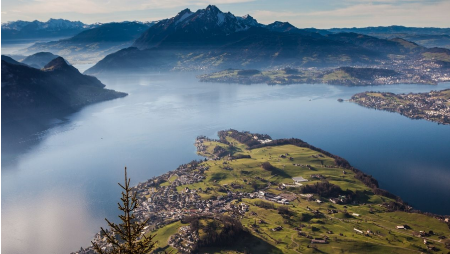
RIGI BAHNEN AG, Schwyzer Wanderwege