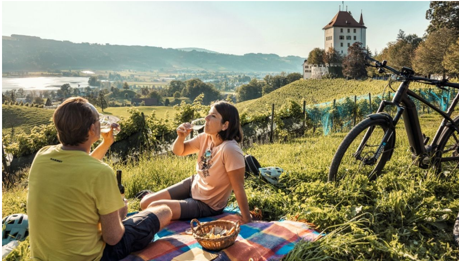
Nico Schärer | Luzern Tourismus